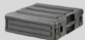
Stackable Edge Micro Pod