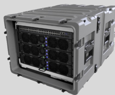
TPX1 – Rugged Edge Cloud Pod

ENFORCER has been funded by the DoD, DHS and others, and is currently deployed in govt data centers. Compact, yet powerful, MIL-STD spec ruggedized ENFORCER tamper-proof servers support in-field edge deployments. In addition to anti-tamper defenses, zeroization or physically self-destruct can also be remotely triggered.